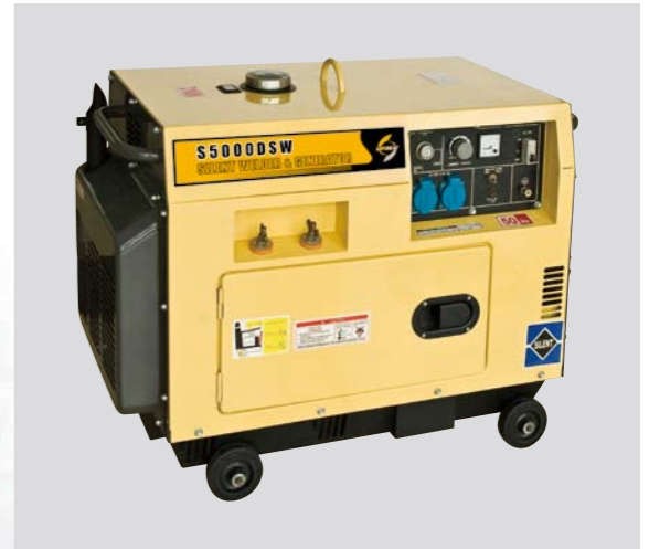
S5000DSW S5000DSW3 S6500DSW S6500DSW3