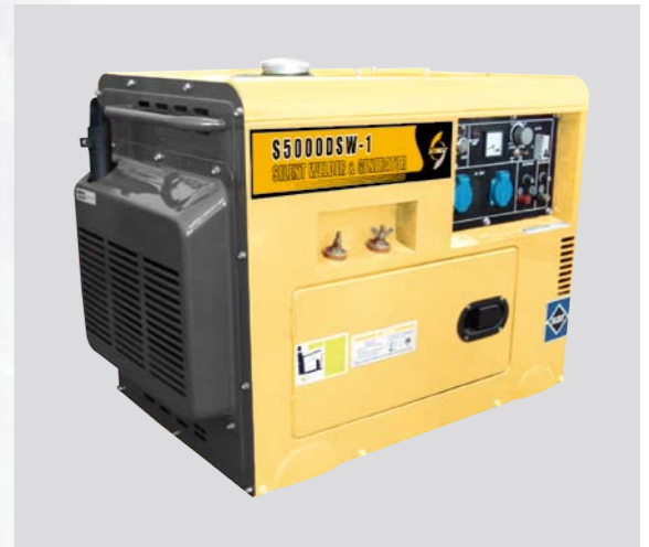
S5000DSW-1 S5000DSW3-1 S6500DSW-1 S6500DSW3-1